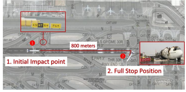
Figure 1. Aircraft Initial impact and final position

The Aircraft aft fuselage lower section impacted first, followed by the engines, the lower section of the aircraft belly fairing, and then the forward fuselage and nose landing gear doors. The No.2 engine separated, moved laterally on the right wing leading edge, and remained near the right wingtip until the Aircraft came to rest.